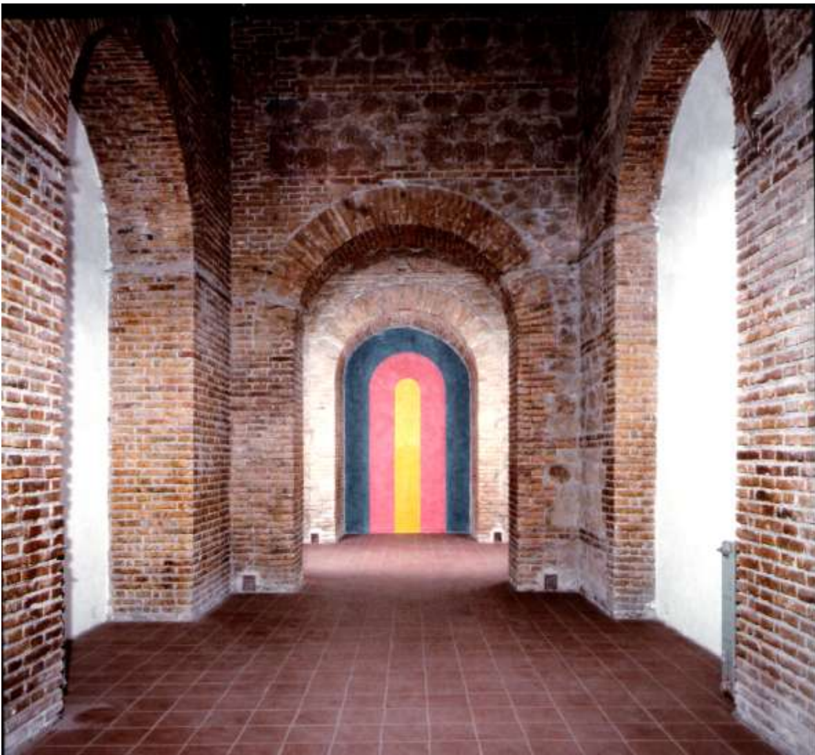
Sol Lewitt, Wall Drawing Sala 1, per "Roman Americans", 1986

La Sala 1 propone un laboratorio artistico per bambini dai 4 ai 11 anni (in gruppi separati) che si prefigge l'obiettivo prima di stimolare e/o tenere in vita i processi creativi.